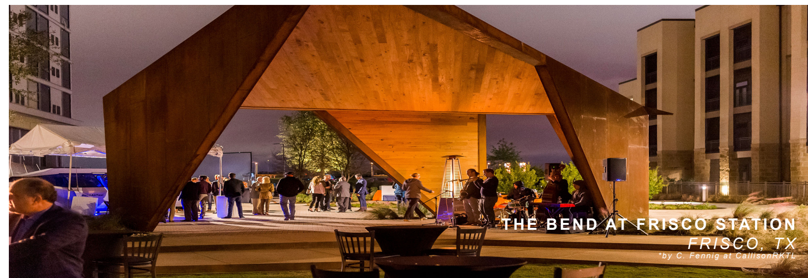
THE BEND AT FRISCO STATION FRISCO, TX *by C. Fennig at CallisonRKT