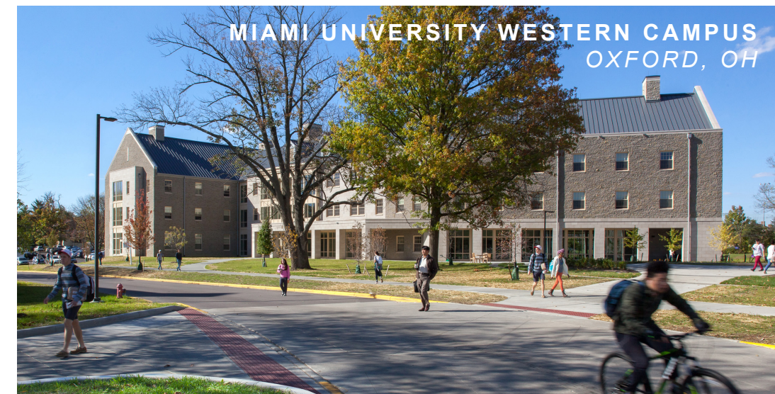
MIAMI UNIVERSITY WESTERN CAMPUS OXFORD, OH