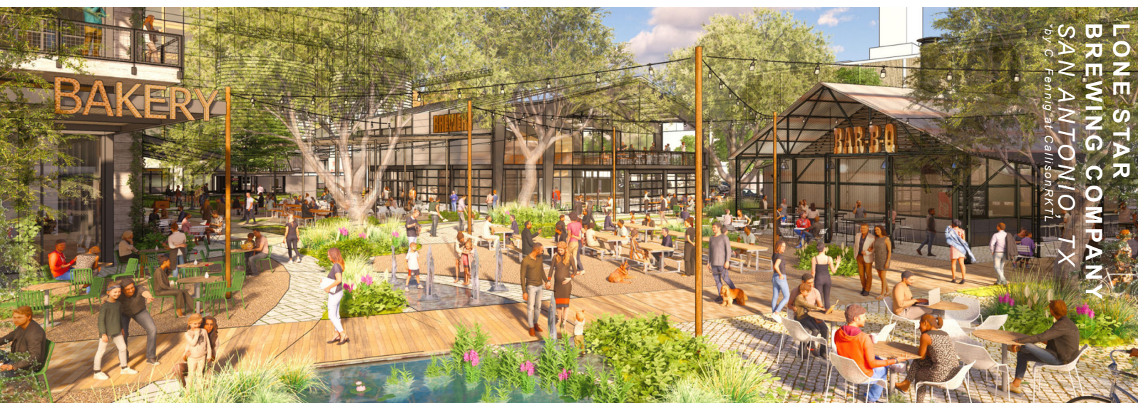
LONE STAR BREWING COMPANY SAN ANTONIO, TX