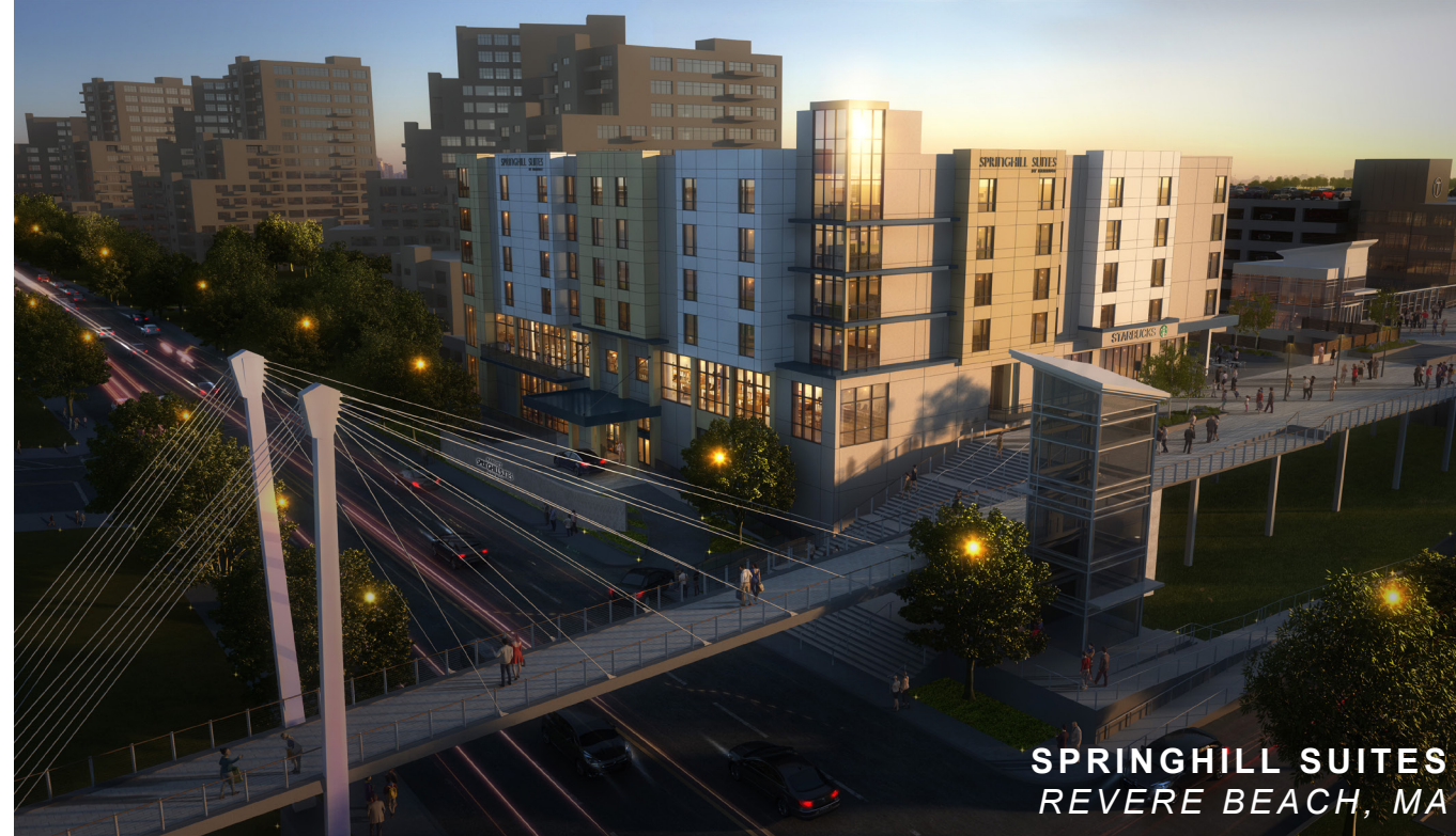
SPRINGHILL SUITES REVERE BEACH, MA

Placemaking provides the context for the spaces to exist. At CR architecture + design we endeavor to create extraordinary places that provide the context for great spaces. Starting with the entry experience at the site arrival, to the transition from the car to pedestrian to decompression spaces at the parking edge, and inventive use of the land form, landscaping, site lighting, and building lighting, to the imaginative use of the voids and negative spaces created between the buildings, we aspire to create meaningful places to house meaningful spaces.