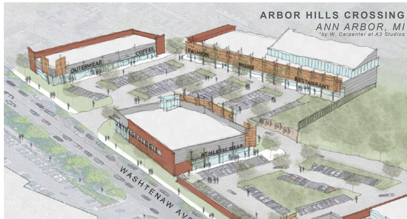
ARBOR HILLS CROSSING ANN ARBOR, MI